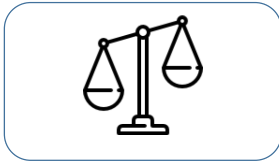
Optimal level of fines